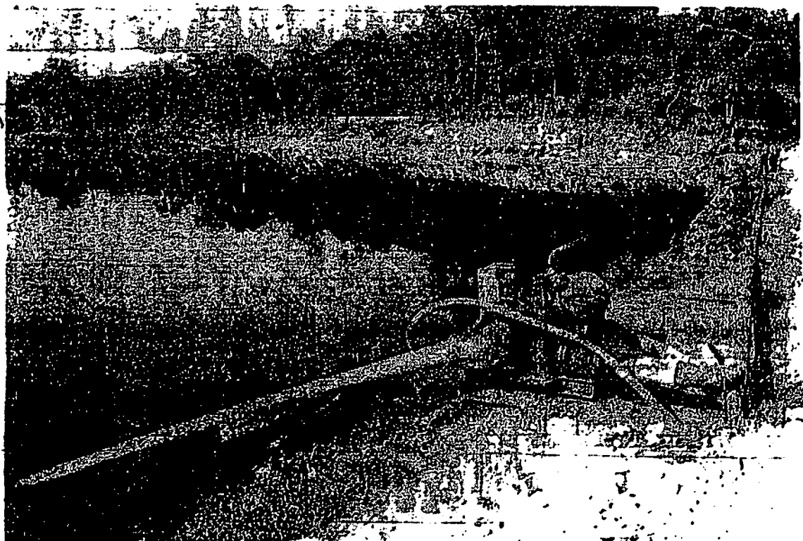
PUMPING OPERATION AT RUMPKLE DUMP LAGOON

Sewer gas is causing monumental odor problems and an angry mood among residents along Struble road in Colerain Township.