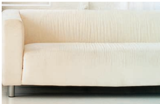
Green clean. New polymers resist stains without breaking down into persistent compounds.

Stain-resistant carpets, upholstery, and fabrics have a dark underside. A common coating that keeps them pristine has recently been found to break down into perfluorooctanoic acid, also known as PFOA or C8, a persistent compound that accumulates inside the body and has been fingered as a possible carcino-